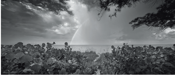
CASEY KEY 5, 2014 Barrier Island, Venice

Selby Gardens is excited to present the extraordinary imagery of legendary photographer and conservationist Clyde Butcher outside throughout the grounds of the Historic Spanish Point campus. Large-scale prints on aluminum of Butcher's beautiful photographs of plants, animals, and habitats of Florida are exhibited in the natural landscape, offering a unique way to experience the artist's work.