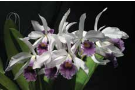
Cattleya Dupreana 'Coerulea' ORCHIDACEAE

Both a naturally-occurring and man-made primary hybrid, this cross of Brazilian natives Cattleya purpurata and Cattleya tigrina produces very tall plants with fragrant flowers. Cattleya require bright light and ample air circulation to look their best. *appearance may differ from photo