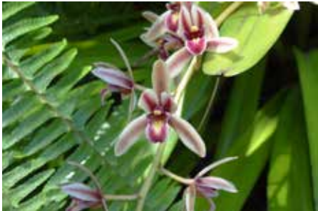
Cymbidium aloifolium ORCHIDACEAE

A perfect addition to butterfly or hummingbird gardens, this easy-care winter blooming shrub hailing from Central America and Mexico, is a sturdy landscape specimen. It can expand to become an 8-10' tall multi-stemmed shrub, unless pruned to desired shape and size.