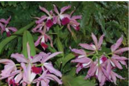
Cattleya x elegans ORCHIDACEAE

This tough orchid loves living in a hanging basket or mounted in an oak tree where it welcomes high temperatures and high humidity. Native to Southern China and Southeast Asia, it will produce summer blooms in either light shade or bright sun.