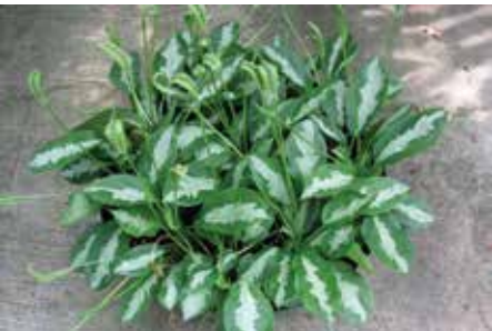
Spathicarpa gardneri ARACEAE

Distribution of plants will take place only on November 8, 2014, from 10:00am until 2:00pm. There are no rainchecks. Also, we are unable to hold or ship plants.