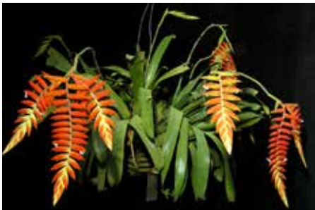
Tillandsia dyeriana BROMELIACEAE

Native to the hot, steamy jungle of S. America, this aroid boasts variegated foliage making it a charming container plant or tucked into a shady, frost-free garden. Thrives with filtered sun and slightly moist, but well-drained soil.