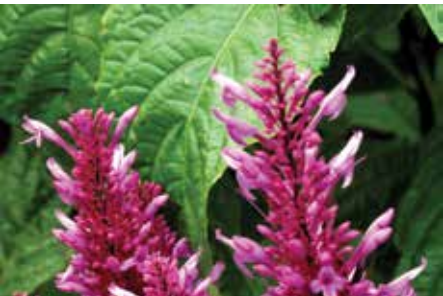
Odontonema callistachyum 'Purple Rose' ACANTHACEAE

Commonly known as Malaysian grapes, this beauty is NOT edible, but is a spectacular and surprisingly easy-to-grow container specimen. Should do well on a lanai or protected part of a landscape - best in a container with porous soil and bright, but indirect, sun.