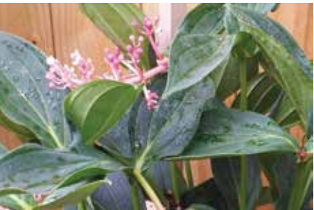
Medinilla myriantha MELASTOMACEAE

Endangered in its native Ecuador, this Tillandsia is worthy of a place in any plant lover's collection. Unlike most tillandsias, it will do well mounted on bark or in a container with fast-draining medium.