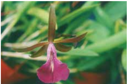
Brassocattleya Hippodamia ORCHIDACEAE

This cross between Brazilian beauties Cattleya warneri and Cattleya warscewiczii will reward growers with large (up to 6"+) highly fragrant blue-tinged blooms. As with all Cattleya , this one appreciates high light levels and the chance to dry out between waterings.